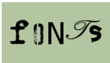
Variable Width Text Object with Font