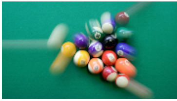
Retrieve BodyPart names from Collision Event