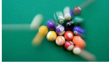
Retrieve Objects from Collision Event