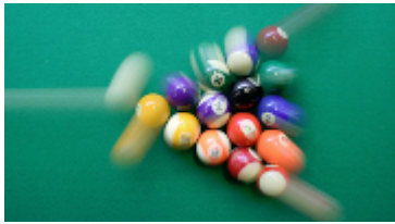
Retrieve BodyPart names from Collision Event